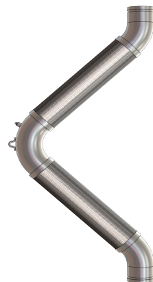
SS FireVoop Seismic Expansion Joint

Metraflex has been supplying piping specialty products since 1958. With the introduction of the UL listed, FireLoop® seismic expansion joint, Metraflex has brought its expertise in seismic expansion joints to the fire sprinkler industry. The introduction and rapid industry acceptance of the FireLoop® for fire sprinkler systems, plus its compliance with NFPA 13 guidelines, has made it the seismic expansion joint of choice.