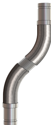
SS FireStrait Flexible Connector